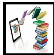
21 st Century Literacy