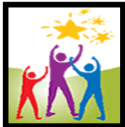
Youth Leadership & Community Engagement