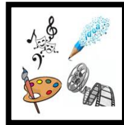
Arts & the Creative Economy