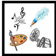
Arts & the Creative Economy